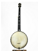
347: E.H. Ferguson Banjo, c. 1900

Banjo Fancy inlays on headstock and neck. Heavy metal-clad inside and full spun over rim. Height 91cm. The Meisel Collection. This instrument is being sold from The Meisel Collection assembled over a period of forty years by an accomplished attorney from Princeton, New Jersey. The owner traveled the world in search of rare, interesting, and handsome instruments to fill a collection that until now was displayed in his beautiful Princeton home. Please note: The items in the Meisel Collection are being sold F.O.B. Princeton, New Jersey. The recommended shipper is the U.P.S. Store, 174 Nassau St., Princeton, NJ 08542 which has extensive experience shipping fragile auction items. The Store can be emailed at store2026@theupsstore.com or called at 609-924-0759. The auction house makes no commission on shipping; payment for shipping is made by the buyer directly to the shipper. Although buyers are free to use any shipper they choose, we have found this shipper to be fair and reliable. Condition: More detailed condition reports and additional photographs are available by request. The absence of a condition report does not imply that the lot is in very fine condition. Please message us through the online bidding platform or email Guernsey's at auctions@guernseys.com to request a more thorough condition report.