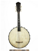
320: Mandolin Banjo