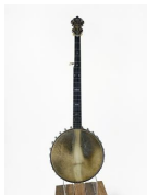
427: J.B. Schall Banjo, c. 1910