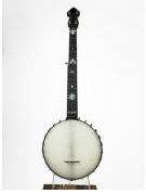
364: J.L. Quinlan Banjo, c. 1880s