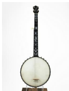
361: Luscomb's Banjo, Patented 1893