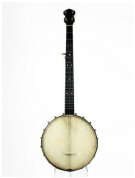
321: John Wesley Banjo, c. 1891

Mandolin Banjo Length: 61cm. The Meisel Collection. This instrument is being sold from The Meisel Collection assembled over a period of forty years by an accomplished attorney from Princeton, New Jersey. The owner traveled the world in search of rare, interesting, and handsome instruments to fill a collection that until now was displayed in his beautiful Princeton home. Please note: The items in the Meisel Collection are being sold F.O.B. Princeton, New Jersey. The recommended shipper is the U.P.S. Store, 174 Nassau St., Princeton, NJ 08542 which has extensive experience shipping fragile auction items. The Store can be emailed at store2026@theupsstore.com or called at 609-924-0759. The auction house makes no commission on shipping; payment for shipping is made by the buyer directly to the shipper. Although buyers are free to use any shipper they choose, we have found this shipper to be fair and reliable. Condition: More detailed condition reports and additional photographs are available by request. The absence of a condition report does not imply that the lot is in very fine condition. Please message us through the online bidding platform or email Guernsey's at auctions@guernseys.com to request a more thorough condition report.