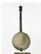
429: Washburn Banjo