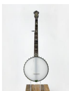
428: Banjo, Possibly Buckbee