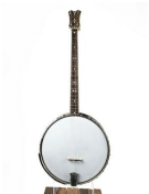
379: Calvert Parker Tenor Banjo