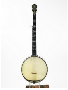
465: A.C. Fairbanks & Co. Banjo, "White Laydie" no. 7