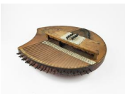
542: Melloharp Company Melloharp