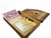
540: Oscar Schmidt International Autoharp

Zimmerman Autoharp Co. Autoharp. 1893 - 1899. Made in Dolgeville, NY. #6. Inlaid wood border. Nice old patina. Small chip (easily restored) on .5" x 3" cover piece. Length: 54cm. The Meisel Collection. This instrument is being sold from The Meisel Collection assembled over a period of forty years by an accomplished attorney from Princeton, New Jersey. The owner traveled the world in search of rare, interesting, and handsome instruments to fill a collection that until now was displayed in his beautiful Princeton home. Please note: The items in the Meisel Collection are being sold F.O.B. Princeton, New Jersey. The recommended shipper is the U.P.S. Store, 174 Nassau St., Princeton, NJ 08542 which has extensive experience shipping fragile auction items. The Store can be emailed at store2026@theupsstore.com or called at 609-924-0759. The auction house makes no commission on shipping; payment for shipping is made by the buyer directly to the shipper. Although buyers are free to use any shipper they choose, we have found this shipper to be fair and reliable. Condition: More detailed condition reports and additional photographs are available by request. The absence of a condition report does not imply that the lot is in very fine condition. Please message us through the online bidding platform or email Guernsey's at auctions@guernseys.com to request a more thorough condition report.