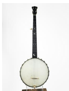
363: C.W. Hutchins Banjo, c. 1890