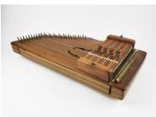
541: Handmade Autoharp

Oscar Schmidt International Autoharp Original box with original paperwork, tuning key, hammer, and more recent instruction manual. Serial #: 6341 in beautiful condition. Length: 49cm. The Meisel Collection. This instrument is being sold from The Meisel Collection assembled over a period of forty years by an accomplished attorney from Princeton, New Jersey. The owner traveled the world in search of rare, interesting, and handsome instruments to fill a collection that until now was displayed in his beautiful Princeton home. Please note: The items in the Meisel Collection are being sold F.O.B. Princeton, New Jersey. The recommended shipper is the U.P.S. Store, 174 Nassau St., Princeton, NJ 08542 which has extensive experience shipping fragile auction items. The Store can be emailed at store2026@theupsstore.com or called at 609-924-0759. The auction house makes no commission on shipping; payment for shipping is made by the buyer directly to the shipper. Although buyers are free to use any shipper they choose, we have found this shipper to be fair and reliable. Condition: More detailed condition reports and additional photographs are available by request. The absence of a condition report does not imply that the lot is in very fine condition. Please message us through the online bidding platform or email Guernsey's at auctions@guernseys.com to request a more thorough condition report.