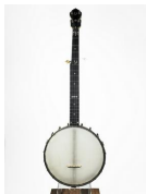
350: W.M. Karnolt Banjo, c. 1880