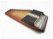
548: Oscar Schmidt International Autoharp, c. 1950