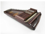
550: Phonoharp Company Autoharp, c. 1895

Zimmerman Autoharp Co. Autoharp. 1893 - 1899. Made in Dolgeville, NY. #6. Inlaid wood border. Nice old patina. Length: 54cm. Edge lining. Length: 54cm. The Meisel Collection. This instrument is being sold from The Meisel Collection assembled over a period of forty years by an accomplished attorney from Princeton, New Jersey. The owner traveled the world in search of rare, interesting, and handsome instruments to fill a collection that until now was displayed in his beautiful Princeton home. Please note: The items in the Meisel Collection are being sold F.O.B. Princeton, New Jersey. The recommended shipper is the U.P.S. Store, 174 Nassau St., Princeton, NJ 08542 which has extensive experience shipping fragile auction items. The Store can be emailed at store2026@theupsstore.com or called at 609-924-0759. The auction house makes no commission on shipping; payment for shipping is made by the buyer directly to the shipper. Although buyers are free to use any shipper they choose, we have found this shipper to be fair and reliable. Condition: More detailed condition reports and additional photographs are available by request. The absence of a condition report does not imply that the lot is in very fine condition. Please message us through the online bidding platform or email Guernsey's at auctions@guernseys.com to request a more thorough condition report.