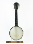
417: Weymann Keystone State Piccolo Banjo Mandolin