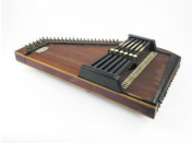
539: Zimmerman Autoharp Co. Autoharp, c. 1893-1899