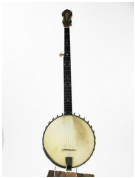
466: Vega Banjo, Tubaphone #3