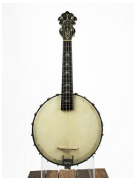
367: Banjo Ukulele

Banjoc. 1880. Head is ripped. Length: 80cm. The Meisel Collection. This instrument is being sold from The Meisel Collection assembled over a period of forty years by an accomplished attorney from Princeton, New Jersey. The owner traveled the world in search of rare, interesting, and handsome instruments to fill a collection that until now was displayed in his beautiful Princeton home. Please note: The items in the Meisel Collection are being sold F.O.B. Princeton, New Jersey. The recommended shipper is the U.P.S. Store, 174 Nassau St., Princeton, NJ 08542 which has extensive experience shipping fragile auction items. The Store can be emailed at store2026@theupsstore.com or called at 609-924-0759. The auction house makes no commission on shipping; payment for shipping is made by the buyer directly to the shipper. Although buyers are free to use any shipper they choose, we have found this shipper to be fair and reliable. Condition: More detailed condition reports and additional photographs are available by request. The absence of a condition report does not imply that the lot is in very fine condition. Please message us through the online bidding platform or email Guernsey's at auctions@guernseys.com to request a more thorough condition report.