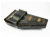
538: Zimmerman Autoharp Co. Autoharp, c. 1893-1899