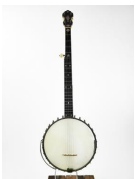
467: A.C. Fairbanks & Co. Banjo, "White Laydie" no. 2