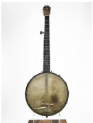
366: Banjo, c. 1880

Banjo Todd, San Francisco. Patent 1891. Walnut sides and back with tiger maple veneer, carved heel. Length: 71cm. The Meisel Collection. This instrument is being sold from The Meisel Collection assembled over a period of forty years by an accomplished attorney from Princeton, New Jersey. The owner traveled the world in search of rare, interesting, and handsome instruments to fill a collection that until now was displayed in his beautiful Princeton home. Please note: The items in the Meisel Collection are being sold F.O.B. Princeton, New Jersey. The recommended shipper is the U.P.S. Store, 174 Nassau St., Princeton, NJ 08542 which has extensive experience shipping fragile auction items. The Store can be emailed at store2026@theupsstore.com or called at 609-924-0759. The auction house makes no commission on shipping; payment for shipping is made by the buyer directly to the shipper. Although buyers are free to use any shipper they choose, we have found this shipper to be fair and reliable. Condition: More detailed condition reports and additional photographs are available by request. The absence of a condition report does not imply that the lot is in very fine condition. Please message us through the online bidding platform or email Guernsey's at auctions@guernseys.com to request a more thorough condition report.