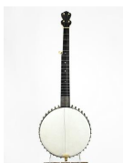
387: Celebrated Benary Banjo, c. 1890-1898