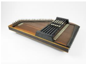
549: Zimmerman Autoharp Co. Autoharp, c. 1893-1899