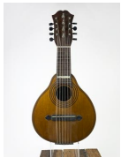
573: Harwood Bandurria

Muller's Autoharp Gorgeous instrument. Labeled "Muller's Erato Harfe." Two hairline cracks on the back. Length: 72cm. The Meisel Collection. This instrument is being sold from The Meisel Collection assembled over a period of forty years by an accomplished attorney from Princeton, New Jersey. The owner traveled the world in search of rare, interesting, and handsome instruments to fill a collection that until now was displayed in his beautiful Princeton home. Please note: The items in the Meisel Collection are being sold F.O.B. Princeton, New Jersey. The recommended shipper is the U.P.S. Store, 174 Nassau St., Princeton, NJ 08542 which has extensive experience shipping fragile auction items. The Store can be emailed at store2026@theupsstore.com or called at 609-924-0759. The auction house makes no commission on shipping; payment for shipping is made by the buyer directly to the shipper. Although buyers are free to use any shipper they choose, we have found this shipper to be fair and reliable. Condition: More detailed condition reports and additional photographs are available by request. The absence of a condition report does not imply that the lot is in very fine condition. Please message us through the online bidding platform or email Guernsey's at auctions@guernseys.com to request a more thorough condition report.