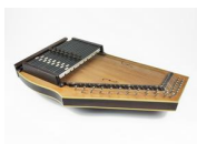
537: Morgan Autoharp