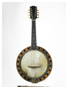
384: Schmick Banjo Mandolin