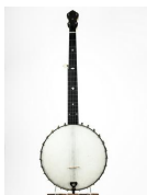
353: C.F. Hanson Banjo