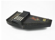
535: Zimmerman Autoharp, "The Favorite"