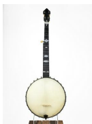
349: J.E. Quinlan Banjo, c. 1890