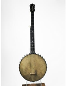
377: H.C. Tallmadge Banjo, c. 1885