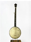
418: J.B. Schall Banjo, c. 1900